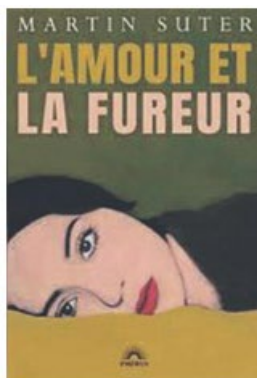
L'Amour et la Fureur MARTIN SUTER

February 2026 Denoël & d'ailleurs Editions